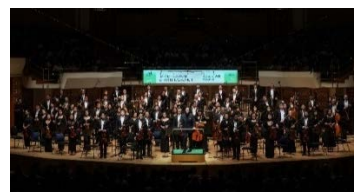
Hong Kong Philharmonic Orchestra