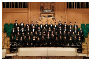
Hong Kong Philharmonic Chorus