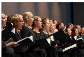
Prague Philharmonic Choir